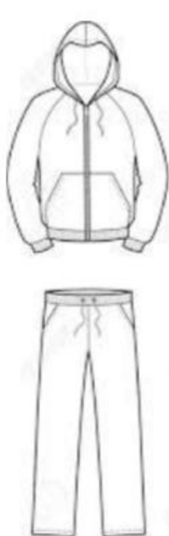
Layer #2 Fleece Jacket/Shirt Fleece Pants