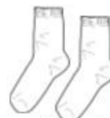
Waterproof, insulated boots Wool socks