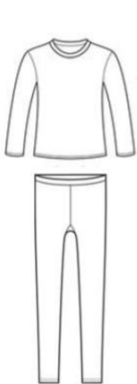
Layer #1 Thermal Shirt Thermal Pants

Remember: NO cotton, NO jeans, and pack lots of extras!