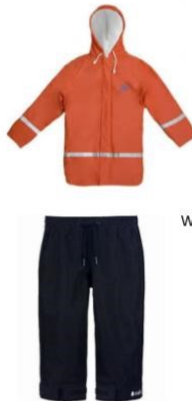
Layer #4 Grunden's rain coat & Oakiwear pants *hand wash only