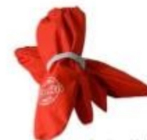
Thin non-cotton glove & waterproof shell (OR)