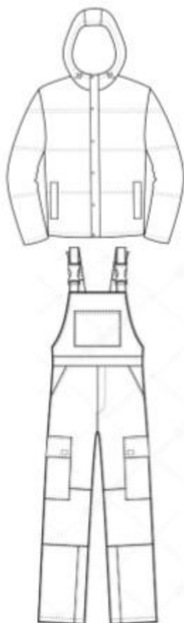
Layer #3 Waterproof winter coat/Puff Jacket Waterproof snow pants